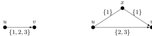
Fig. 2. Example of application of Rule 3.

An example of this rule is given in Rule 3.