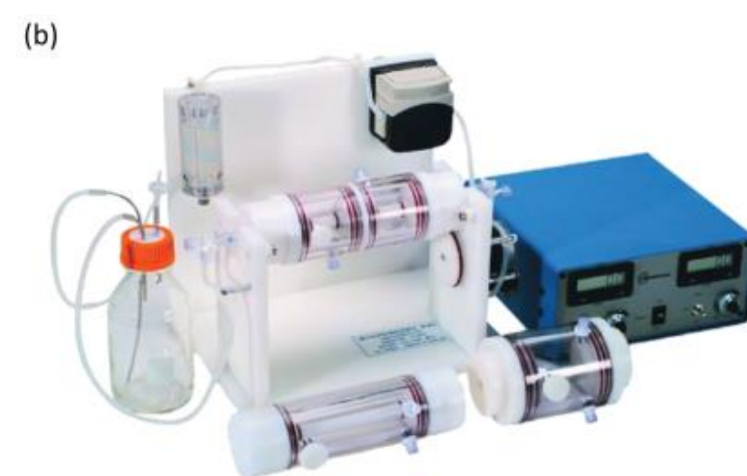
Fig. 1: Rotary Cell Culture System (RCCS)

Particle mass | Viscous drag | Centrifugal force | Coriolis force | Particle weight compensated by Archimedes Acceleration