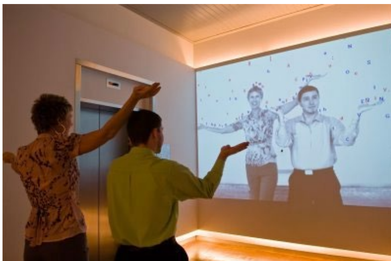
Figure 3. Text Rain , by Camille Utterback and Romy Achituv (1999).

“Insofar as the installation does not aim at the reading of the text, it acts rather as digital art than as literature. Therefore my suggestion of differentiation is not so much based on proportionality but on the role played by the text as a whole.” (Simanowski, 2007: 53). If the text is considered in the creation as a linguistic phenomenon to interpret, one can speak of digital literature. If the text becomes a visual object of interaction (as in the installation Text Rain ), it is more digital art. The tension on the semiotic